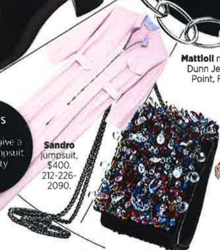
Missoni bag, $1,595. missoni.com.