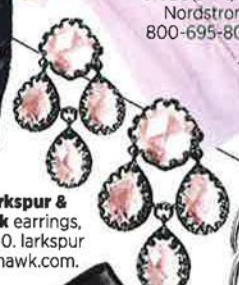
Larkspur & Hawk earrings, $1,800. larkspurandhawk.com.

30s Channel your winter blues into graphic color-blocking and bold stripes.